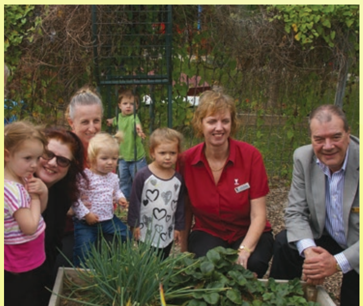
Mirboo North & District Community Foundation, YMCA and South Gippsland Shire Council celebrate the announcement of the continued operation of Mirboo North St Andrews Child Care Centre with some of the kids from the Centre.

The Foundation provided new equipment funding of $10,000 and significant financial support resources to assist recovery. The Foundation worked closely with the South Gippsland Shire Council and the new operators of the Centre, YMCA Ballarat, to ensure the continued operation of the service.