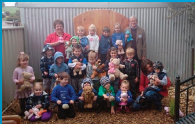
Reading Chair with kinder children and funders at the Teddy Bears Picnic opening

In November of 2013 Thorpdale and District Kindergarten received a grant of $5,535 from the Mirboo North & District Community Foundation to develop a sensory garden.